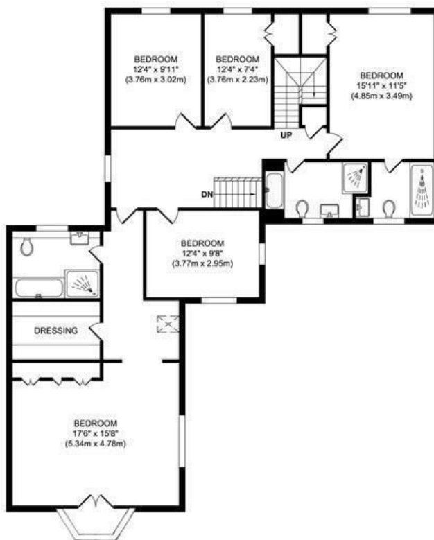
FIRST FLOOR APPROX. FLOOR AREA 1448 SQ.FT. (134.56 SQ.M.)